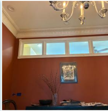
The UNI Fort being rebuilt.