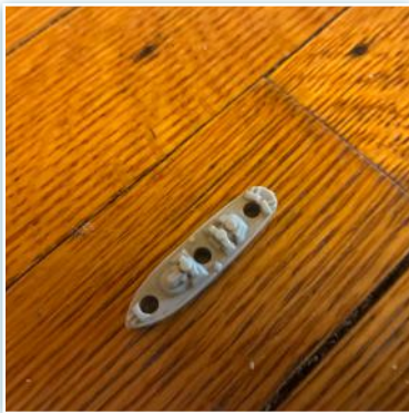
Ethanlish Destroyer Gumdrop