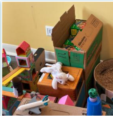
Little Lights City